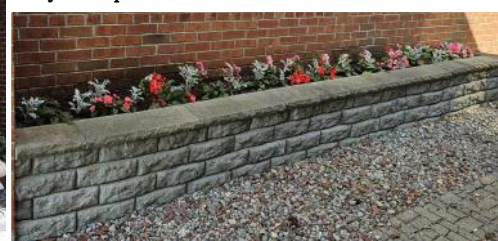
Check out the beautiful flower box welcoming you at the front entrance of St. Mary's Campus!