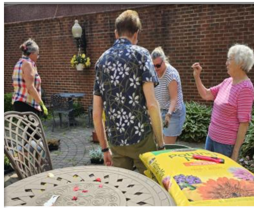
On May 21, 2024, St. Mary's Auxiliary members were busy planting and beautifying the garden at St. Mary's Campus.

We are also grateful to the Facilities Department associates for their assistance.